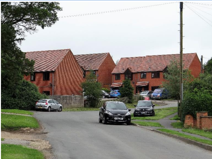
Approach to Harolds Orchard from village centre